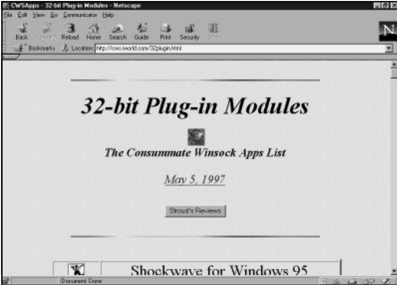
FIGURE 8.2 Stroud's List site reveals a variety of plug-ins and other categories to explore.

From here, you can link to specific plug-ins for downloading onto your computer.